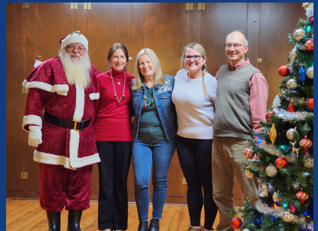
M&O Holiday Party